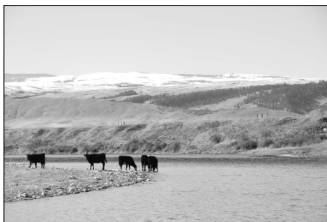
Black Angus on the river bank, a familiar sight on the Bighorn.

and sediment deposits that have resulted in the disappearance of the side channels of the Bighorn River. The project will reestablish fish habitat, angling opportunities, and enhance the overall health of the river. Two of the larger and longer river side channels, the