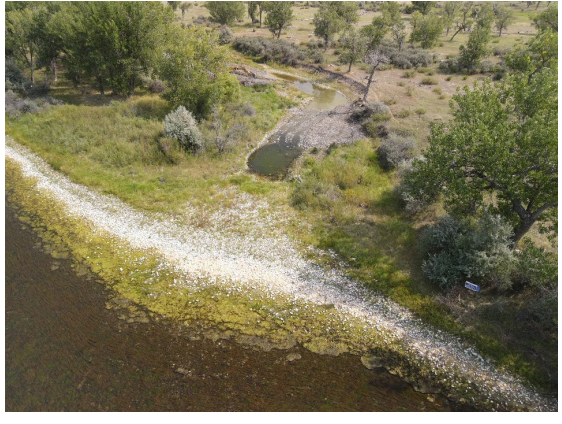
Juniper Side Channel Before