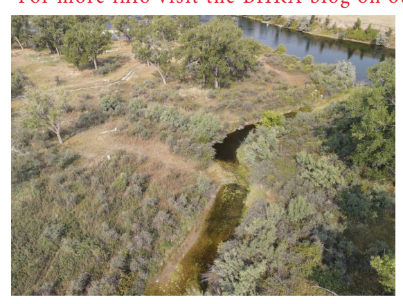
Rattlesnake Side Channel Before

BHRA is proud to announce that work on Rattlesnake and Juniper side channels is complete, restoring .45 miles of complex habitat back to the Bighorn River and its wild trout. Since dam construction Bighorn side channels have become increasingly disconnected due to channelization of the river, sediment infilling and vegetation encroachment at channel entrances. This August contractors excavated a total of 540 cubic yards of material from the entrances of both Rattlesnake and Juniper channels, and within their length, to restore connection with the main river. BHRA will be monitoring the success of these projects throughout the year, while also preparing plans for much larger, multi-channel reconnection effort in 2023. For more info visit the BHRA blog on our website, or check us out on YouTube!