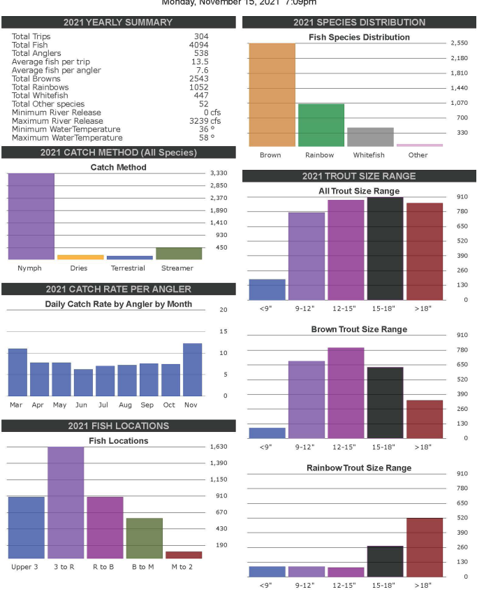
Year-to-Date FishLog Report Monday, November 15, 2021 7:09pm

While cumulative data are yet to be analyzed, the year-to-date report (pictured right) reveals interesting findings. Most striking is the 2:5 dominance of Brown Trout over Rainbow Trout and the different size distributions of the two species. For more information on FishLog visit the 2021 Research Report on the website.