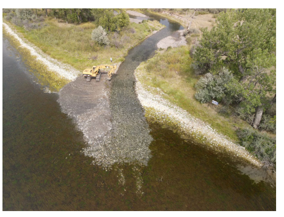
Juniper Side Channel After