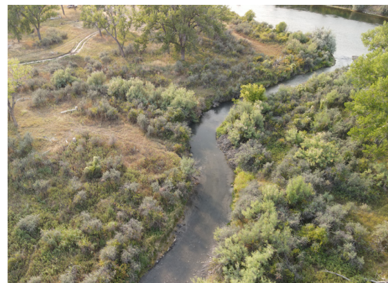
Rattlesnake Side Channel After